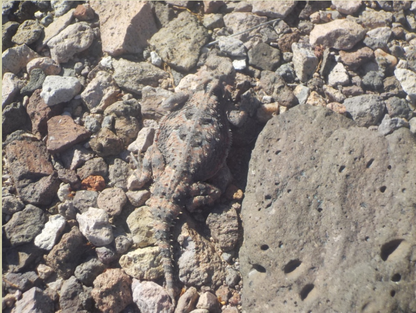
Desert horned lizard ( Phrynosoma platyrhinos )