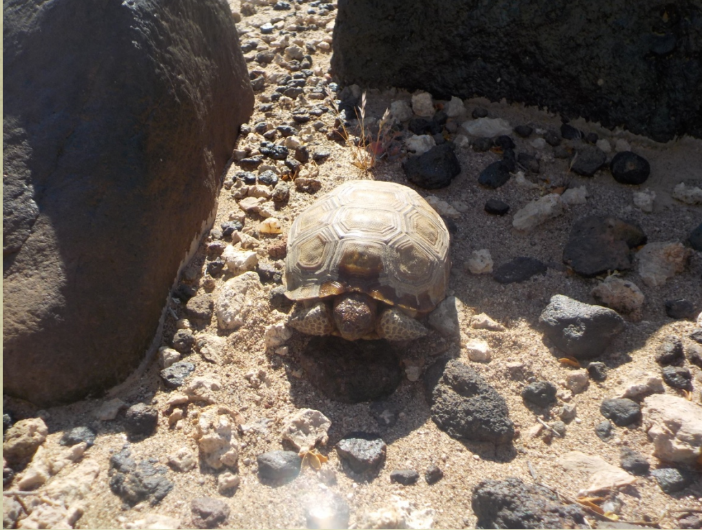
Desert tortoise post rehydration