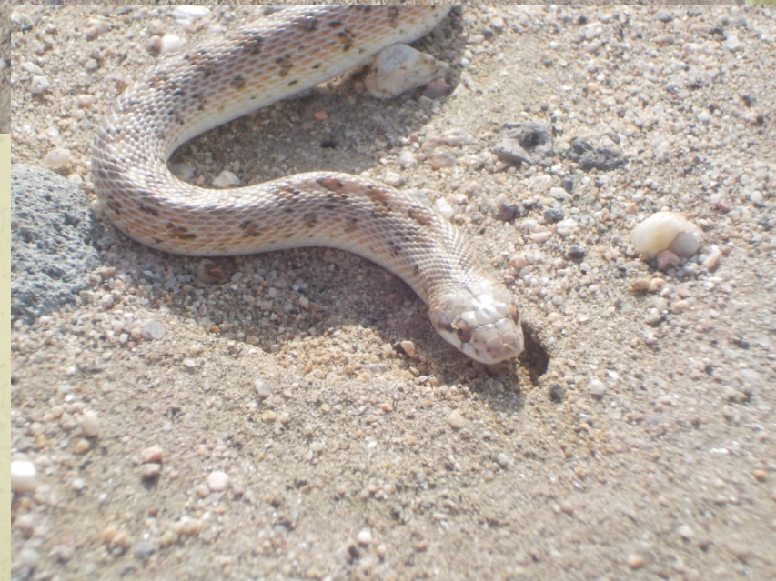
Glossy snake ( Arizona elegans )