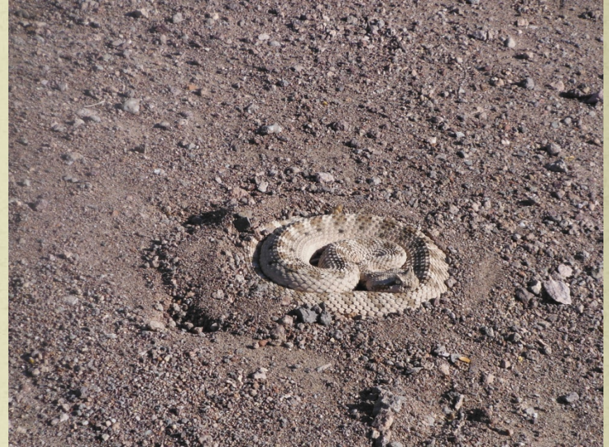
Sidewinder ( Crotalus cerastes )