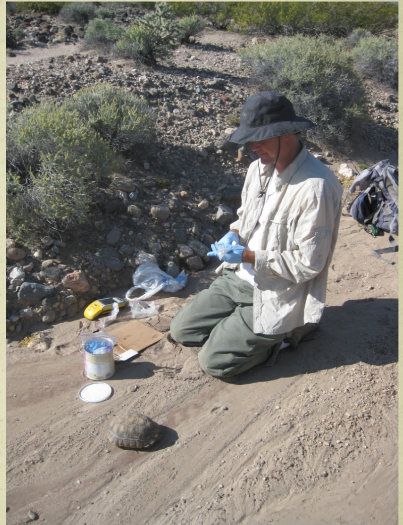
Preparing to tag and measure a tortoise