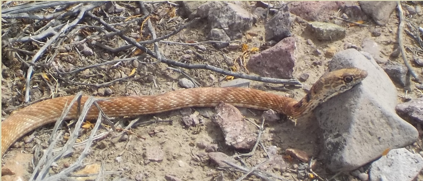
Coachwhip ( Masticophis flagellum )