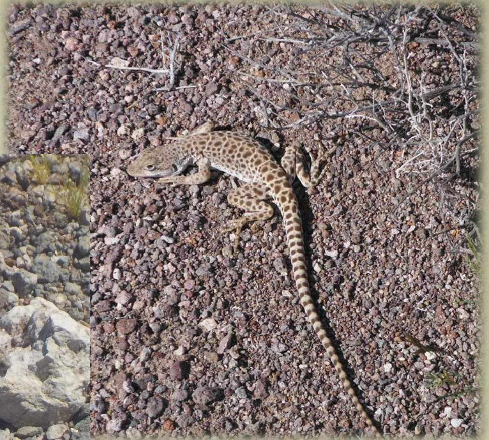
Leopard lizard ( Gambelia wislizenii )