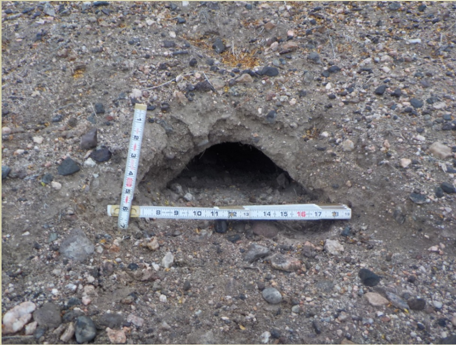
Burrow photograph with ruler