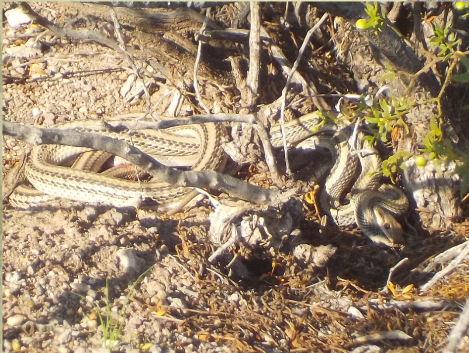
Striped Whipsnake ( Masticophis taeniatus )