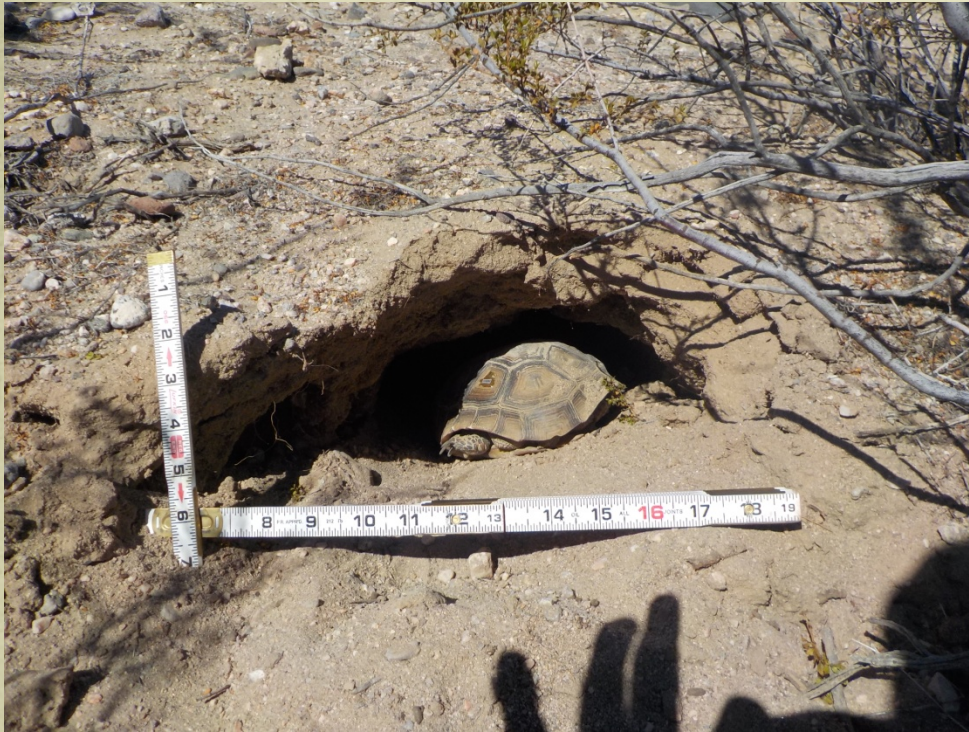
Tortoise in burrow with new tag